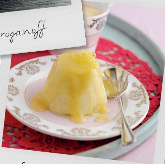
Lemon Sponge Pudding